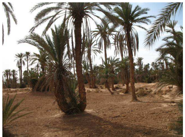
The Targmuiste palm grove: in a state of advanced degradation (pictures above)