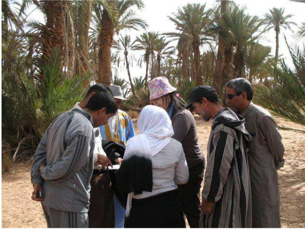
Project team on site