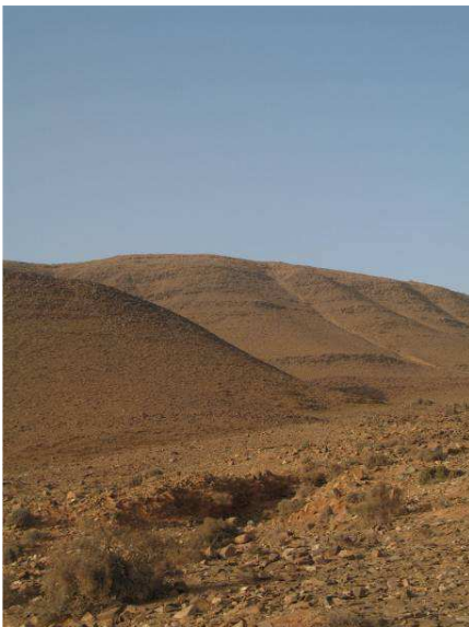
Site of forest plantations and micro-catchments