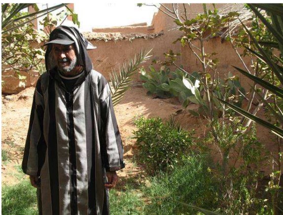
Members of the association in one of the last oasis gardens of the village