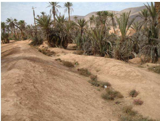
Tracing of old water pipes