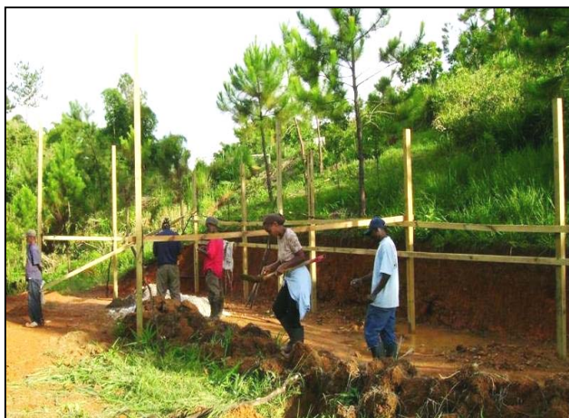
Woodford community members work together to construct a greenhouse

This CBA project aims to reduce the risks of landslides and flooding from heavy precipitation, as well as the adverse effects of extreme drought in Glengoffe's areas. It has been developed by GDCBS through a participatory process involving the different stakeholders of the community. The project bolsters the adaptive capacity of the Glengoffe communities and its ecosystems through three primary activities: 1.) contouring of farming and terracing, 2.) reforestation, and 3.) drought mitigation. These activities are accomplished through the following actions: